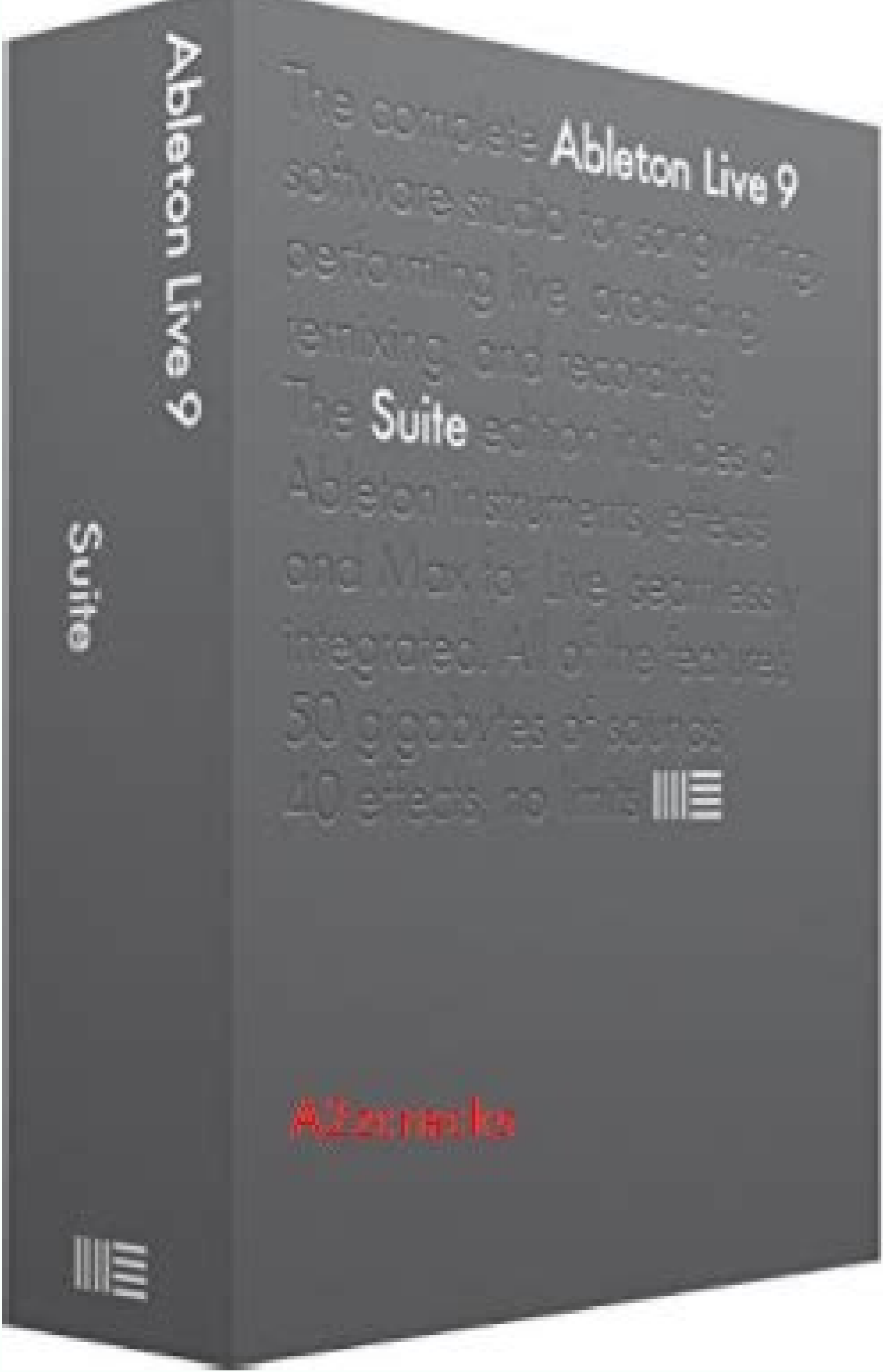
Ableton live 10 reference manual. How to use a reference track in ableton.